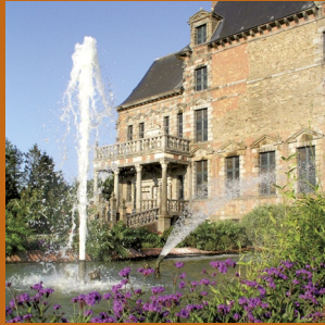
Château des Montgomery (17 th century) - Ducey

Then take the quiet country roads, offering unique views of the Bay and the Mont Saint-Michel, listed UNESCO World Heritage site since 1979. Cycle from one world to the other surrounded by a rich diversity of landscapes.