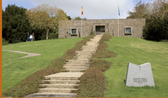
German Military Cemetery Huisnes-sur-Mer

From Ducey, follow the rivers Sée and Sélune to reach the town of Pontaubault where you leave the green way.