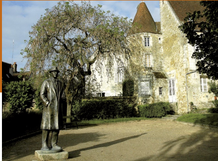
Museum " Memorial Alain" - Mortagne-au-Perche

In Mortagne-au-Perche, the trail crosses the town's urban areas towards the western countryside of Alençon.